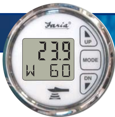
Dual Temperature Depth Sounder